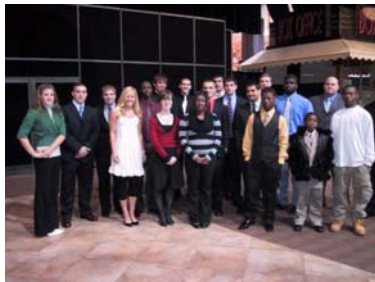
To the left is pictured some of the award winners and scholarship recipients held at the CTCC Annual Awards Banquet at the IX Center on February 18, 2008.

The Cleveland Touchdown Club Charities Annual Awards Banquet is the oldest "football only" awards banquet in the country. Awards are presented to the outstanding players and coaches at the professional, collegiate, and high school level for their excellence throughout the season. The Touchdown Club also honors the MVP's of the Cleveland Mundy Football League and awards scholarships to graduating high school students.